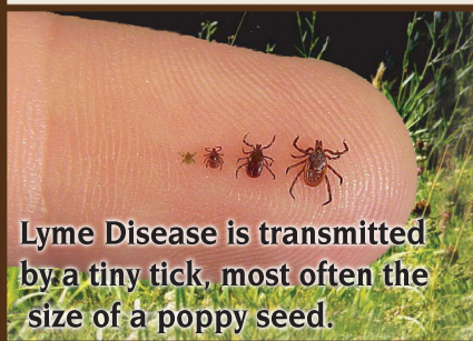
Lyme Disease is transmitted by a tiny tick, most often the size of a poppy seed.