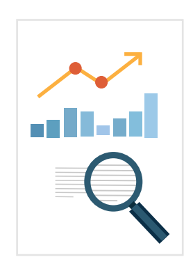
78% worry about healthcare data privacy